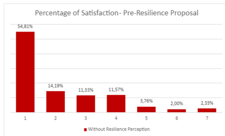
Figure 1 - Dissatisfaction in the scenario with lack of resilience

It was presented to the research participants, through the questionnaire, 10 scenarios in which these people would place themselves and there was an internet failure (with no return forecast), such as online classes, job interviews and work meetings, for example. They were asked how they would feel on a scale of 1 to 7, where 1 would be very dissatisfied and 7 would be very satisfied. Figure 1 shows the percentage of dissatisfaction with the internet failure from a perspective without a resilience device. Note that total dissatisfaction is around 54.81%.